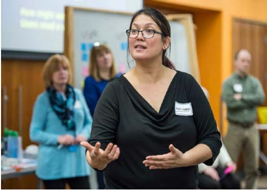
Notre Dame Professor teaching a TAS seminar

The Teachers As Scholars program at the University of Notre Dame was initiated in 2000 through a starter grant from the Woodrow Wilson National Fellowship Foundation, in collaboration with 30 other campuses. Today, only Harvard, Princeton and Notre Dame continue this unique engagement with area teachers. At Notre Dame, TAS is currently